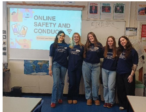
Street Law Volunteers at Bishop Vaughan School, March 2026