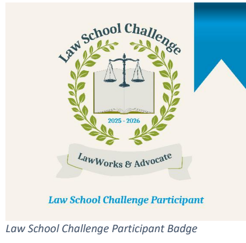
Law School Challenge Participant Badge

Our Fundraising Committee again took part in the LawWorks Law Schools Challenge to raise money for LawWorks and Advocate. 17 students joined our team and a number of fundraising events were held over the course of the academic year including a Pub Quiz and Craft Events.