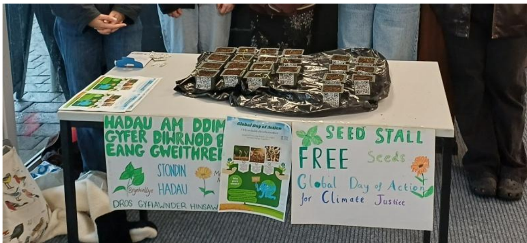
"Seed Stall" Global Day of Action for Climate Justice

We have again taken part in this annual event organised by the University of York. University law clinics from across the globe commit to doing one thing to raise awareness of the climate emergency and to think about the role law teachers, lawyers and law students can play in tackling major societal changes such as climate change. This year the theme was “Decarbonisation” and the Clinic organised a hike across Gower, along with a “Seed Stall” and a talk. All events were held in the lead up to the Global Day of Action on 17 th November 2025.