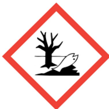
Figure 1: Hazard symbol ‘Dangerous for the environment’

In addition to this, any substance that is identified as environmentally hazardous cannot be disposed of via the drain network. This can be checked by reviewing the hazard/risk phrases on a substances packaging and/or Material Safety Data Sheet (MSDS) and for looking out for symbol shown in Figure 1 and hazard phrase HP14 - Ecotoxic.