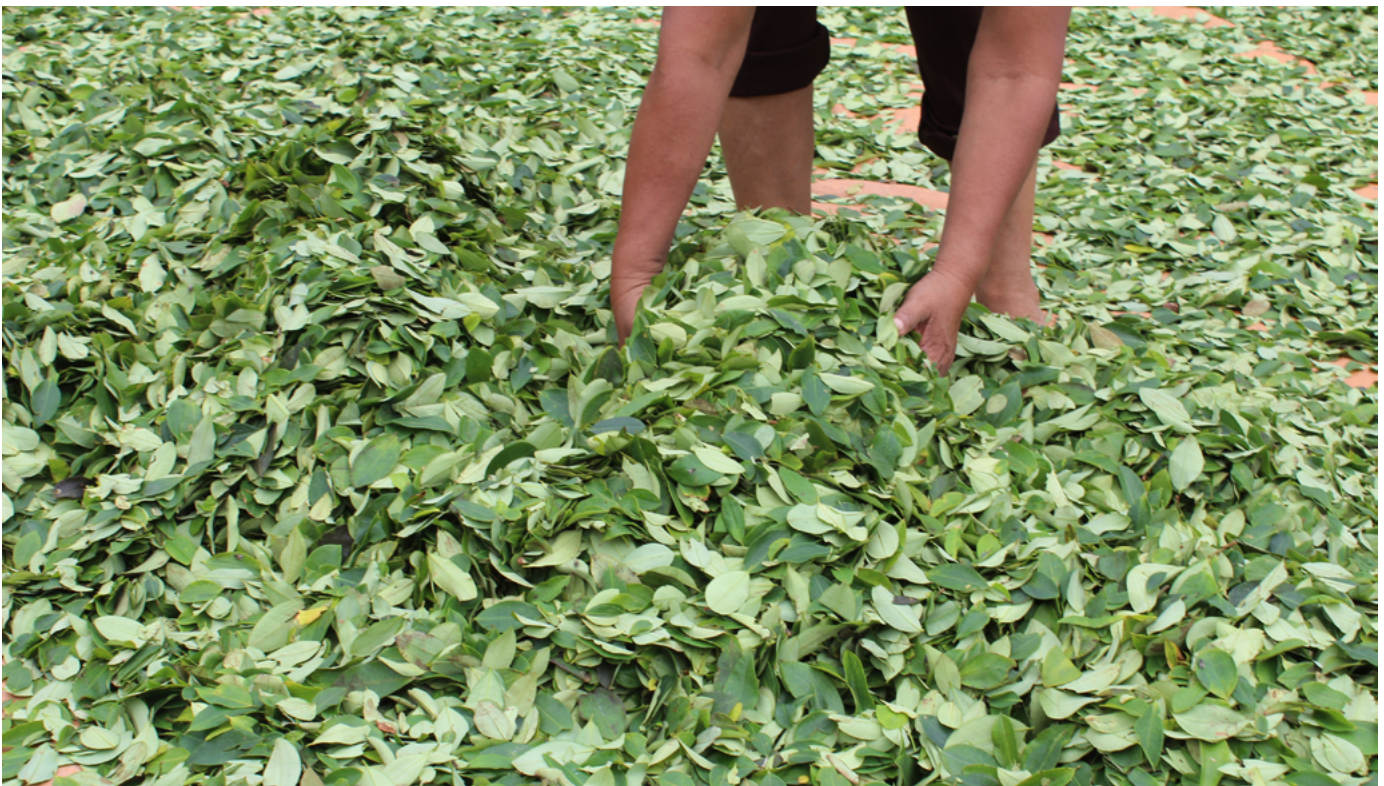
Coca is dried in Bolivia.

following the same treaty procedure, but there are differences to be taken into account. The main legal issue relates to article 19 of the VCLT, which requires that a reservation must not be “incompatible with the object and purpose of the treaty.” Those overall aims of the Single Convention are expressed in the preamble’s opening paragraph regarding concern about “the health and welfare of mankind” and the treaty’s general obligation to limit controlled drugs “exclusively to medical and scientific purposes.” Making a reservation exempting a particular substance from the treaty’s general obligation to limit drugs exclusively to medical and scientific purposes is explicitly mentioned in the Commentary on the Single Convention as an option that could be procedurally allowable, for coca leaf as well as for cannabis. 47 While the absence of any accompanying cautionary text seems to imply that exemption by means of a reservation of a specific substance from the general obligations would not in itself constitute a conflict with the object and purpose of the treaty as a whole, this would certainly be an important legal discussion to be had in the context of crafting reservations. The same issues would arise with an inter se agreement (see above), which comes close to a form of “collective reservation.”