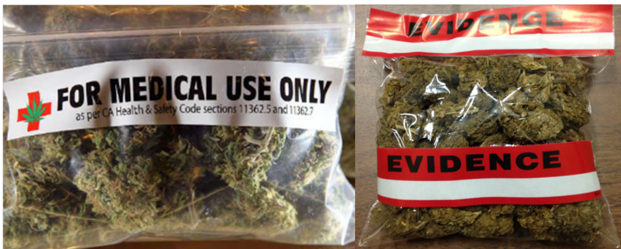
Above, cannabis as both a licit medical product and police evidence.