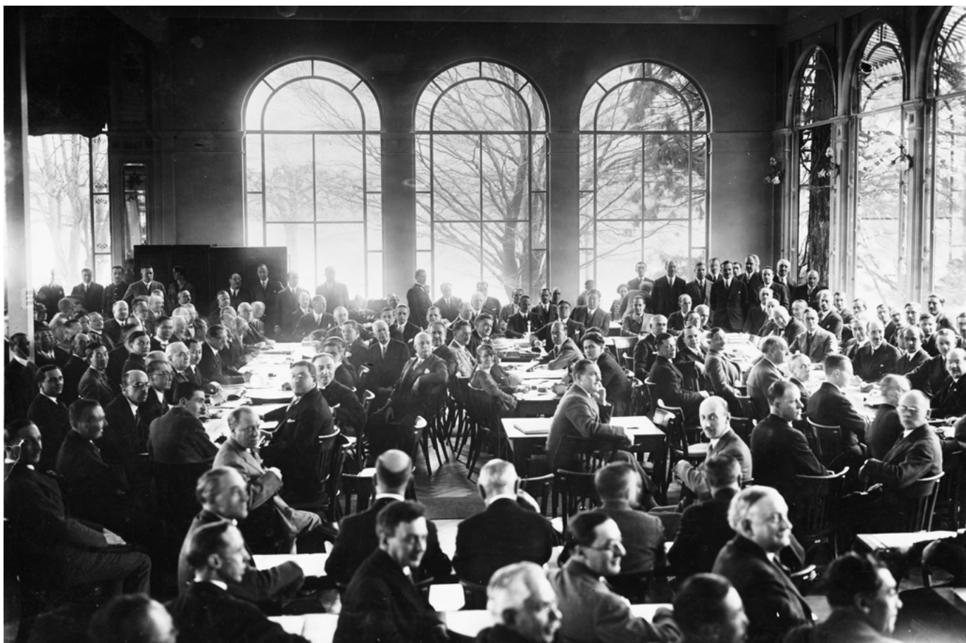
Second Opium Conference in Geneva, 1924-1925.

The Rise and Decline of Cannabis Prohibition (Transnational Institute & Global Drug Policy Observatory, March 2014), https://www.tni.org/en/publication/the-rise-and-decline-of-cannabis-prohibition