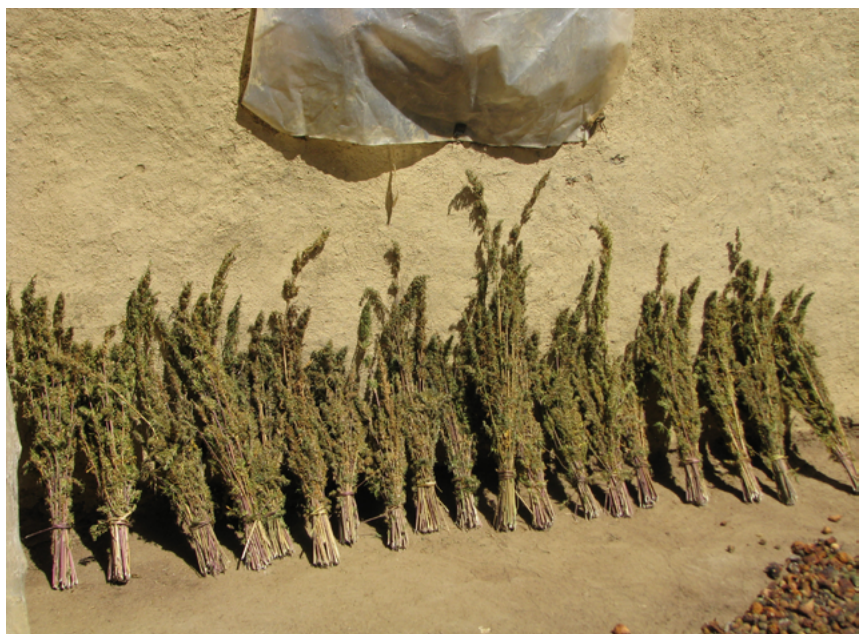
Cannabis drying in Morocco.

Moreover, what we can now see is that it is not the case that States will face significant condemnation from the international community for cannabis reforms that are increasingly common practice across the world. Opting for reform and acknowledging non-compliance can help set the stage for treaty reform options that can be implemented collectively among like-minded States, such as the inter se option.