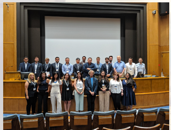
The IISTL Team with our current students and alumni at the Athens Event in July