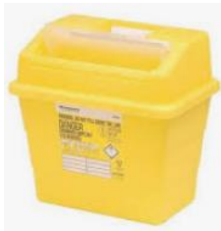
Figure 1: Yellow Sharps Bins (4/7/30 litre available)

All sharps must be placed into yellow lidded sharps boxes, under no circumstance should any sharps be placed into internal bins, or external waste and recycling bins.