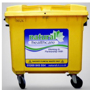
Figure 2 – External yellow bins for temporary storage of orange bags

For disposal, please ensure bags are sealed for transport. Orange bags must be taken back to the following locations;