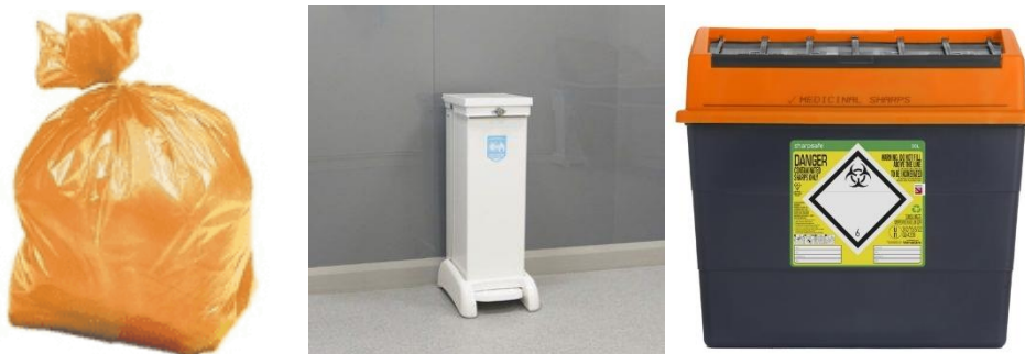
Figure 1 - Orange bag and approved clinical grade bin / Orange lid rigid yellow clinical bin

Each bin must have a Hazardous Infectious Solid Clinical Waste Only sign placed onto it which can be found below.