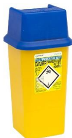
Figure 2 - Blue-topped yellow ridged bin

All waste medicines outlined must be placed into a 7ltr, 11ltr, or 24ltr blue lidded , clinical waste box.