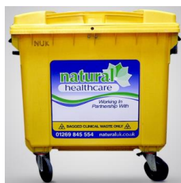
Figure 2 – External yellow wheelie bin