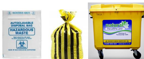
Figure 1 Cat A Waste disposal route for FSE/FMHLS