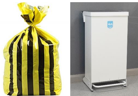
Figure 1 – Tiger bag and preferred metal fire-proof bin

For Autoclaved waste see WMGN30 Biological and consult the Faculty's' appointed Biological Safety Officers (and/or health and safety leads) for further guidance.