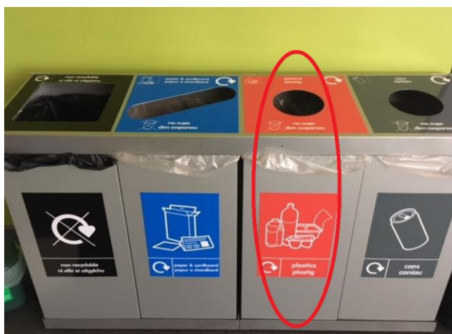
Figure 1 – Swansea University indoor "quad" bins

Only metal, top-opening quads/duos are to be used for plastic disposal. All receptacles will be labelled as "Plastic" and have a clear bin bag. No personal/under-desk containers should be in used in offices as it deters from recycling materials.