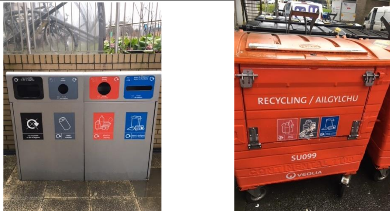
Figure 2 – Swansea University external “quad” bins and external contractor bin

Collected clear bin bags will be deposited into the larger-dedicated bins (provided by the waste management contractor), which are located in compounds across the University’s estates.